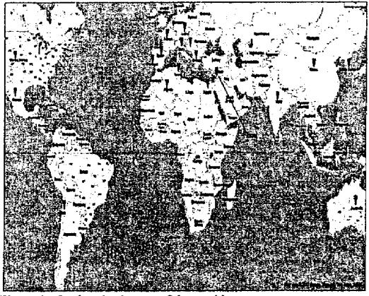
Figure 1: Explored salt pans of the world

unique metabolic pathways, reproductive systems and sensory and defense mechanisms because they have adapted to extreme environmental conditions ranging from cold polar seas (-2°C) to hot hydrothermal fluids (300°C) at the sea floor("Hydrothermal Vents") and also to very high hydrostatic pressures (500-1000 atm). Another unique feature of these organisms, including microbes, is their ability to tolerate high salt concentrations (even up to 10-35% NaCl in salt pans). Numerous bioactive metabolites with antimicrobial, cytotoxic, antiviral, anti-inflammatory, anticongulant and antiparasitic properties have been reported from marine invertebrates, seaweeds, fish, sea snakes, marine mammals, microhes and also from microhes associated with marine flora and fauna [1, 2]. Several researchers have described and reviewed the biomedical potential of marine natural products [3, 4]. Bioactive secondary metabolites reported from the marine environment are depicted in Fig. 1. Some bioactive metabolites have been harvested from marine solar salterns which is a habitat for hypersaline microbes. A unique feature of these microbes is their ability to tolerate high salt concentrations (even up to 10-35% NaCl in salt pans).