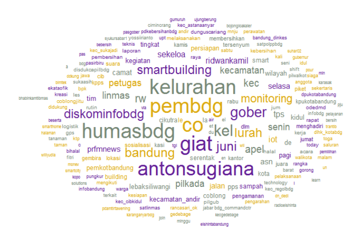
Figure 2. Word Cloud Illustration